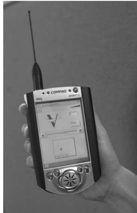
Figure 2: Vanu, Inc. iPAQ Software Radio

The iPAQ contains a 206 MHz StrongARM processor running Linux, with 32 MB of DRAM and 16 MB of Flash. The system could be upgraded easily to a 400 MHz Xscale iPAQ, with significant power savings, in addition to an increase in processing capability. The radio applications run under Linux, and can be controlled locally using the touch screen, or remotely via a serial link. On the current 206 MHz StrongARM, we can support two way FM radio and APCO Project 25, plus other low bandwidth waveforms like TDMA and CDPD, provided the RF transceiver can access the appropriate bands. Upgrading to a 400 MHz Xscale will add GSM capabilities to the list.